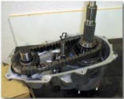
(Fig. 5A) New Main Output Shaft Assembly