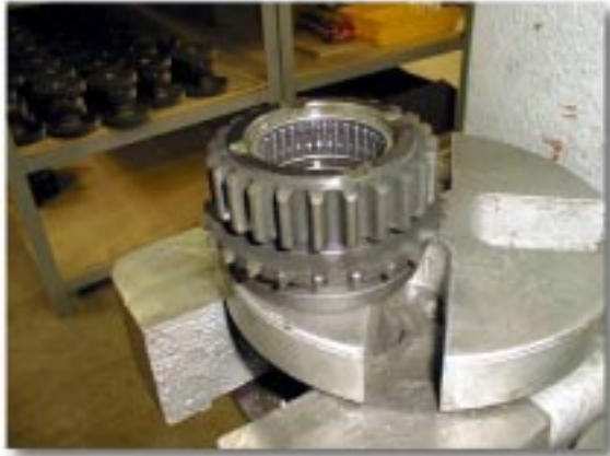
(Fig. 1A) Drive Sprocket Needle Bearings