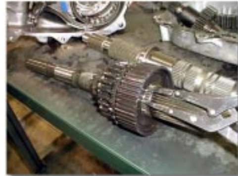
(Fig. 12) Front Drive Chain & Shaft Removal