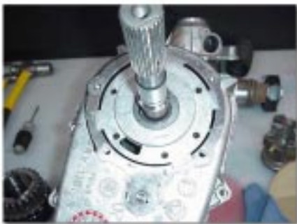
(Fig. 10) Oil Pump Removal