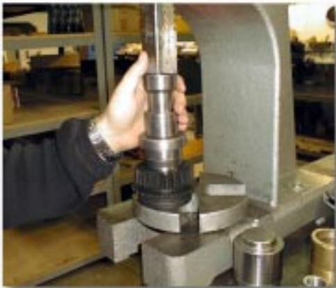
(Fig. 2A) Pull the Needle Bearings Out

On 1997 and newer transfer cases, the drive sprocket does not use caged needle bearings. If you have this newer style, then continue on to Fig. 3A (2).