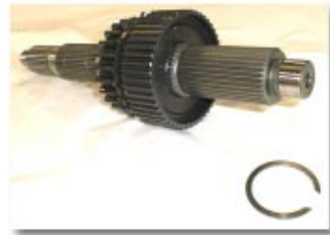
(Fig. 4A) (Large) Retaining Ring Installation