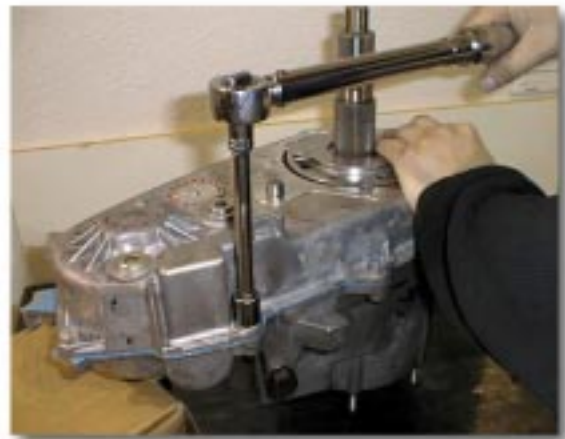
(Fig. 8A) Case Halves Assembled