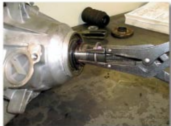
(Fig. 4) Stop Spacer & Snap Ring Removal

SPECIAL NOTE: The components packaged in this kit have been assembled and machined for specific type of conversions. Modifications to any of the components will void any possible warranty or return privileges. If you do not fully understand modifications or changes that will be required to complete your conversion, we strongly recommend that you contact our sales department for more information. This instruction sheet is only to be used for the assembly of Advance Adapter components. We recommend that a service manual pertaining to your vehicle be obtained for specific torque values, wiring diagrams and other related equipment. These manuals are normally available at automotive dealerships and parts stores.