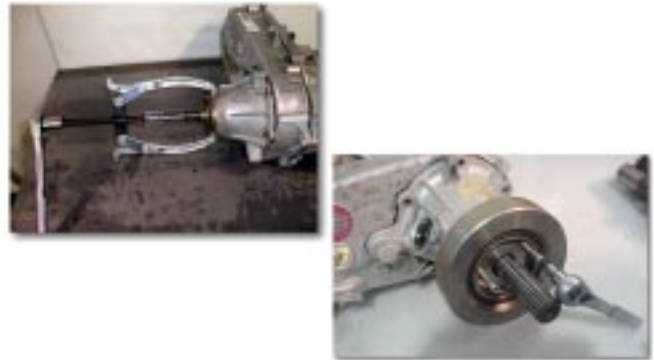
(Fig. 3) Slinger Removed / Harmonic Dampener