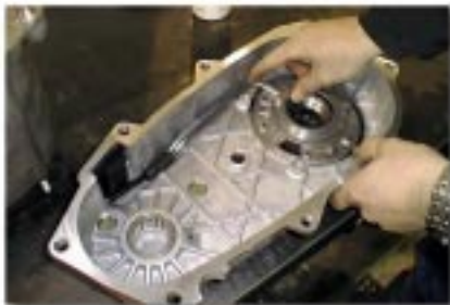
(Fig. 6A) Case Half Pre-assembly