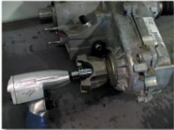
(Fig. 1) Yoke Nut Removal