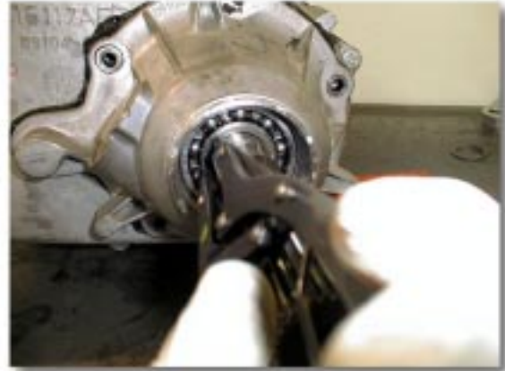
(Fig. 7) Rear I.D. Snap Ring Removal