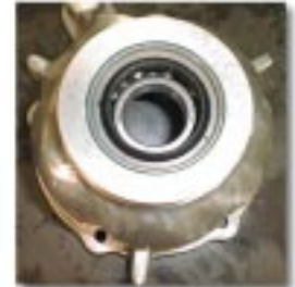
(Fig. 11A) Seal Installed