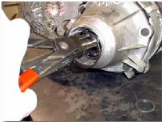
(Fig. 6) Rear O.D. Snap Ring Removal