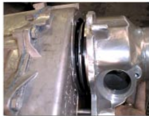
(Fig. 12A) Tailhousing Installation