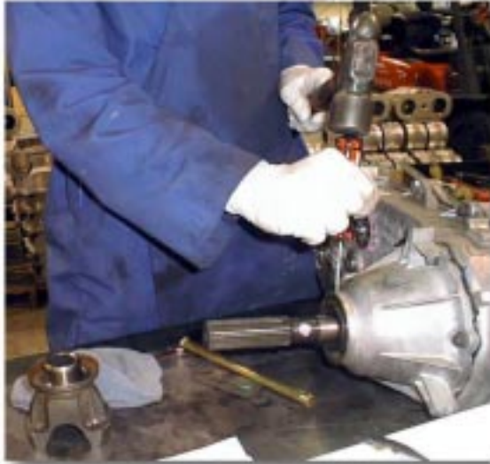
(Fig. 5) Rear Seal Removal