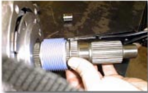
(Fig. 9A) Speed-o- Ring Gear Install