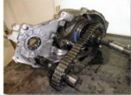
(Fig. 11) Front Drive Chain & Shaft Removal