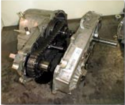
(Fig. 9) Rear Case Half Removal