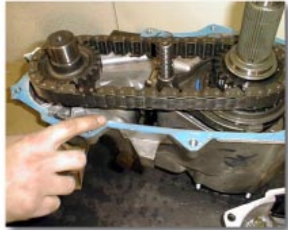
(Fig. 7A) Thin film RTV Applied Prior to Mating Case Halves.