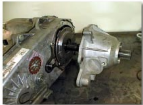
(Fig. 8) Rear Tailhousing Removal