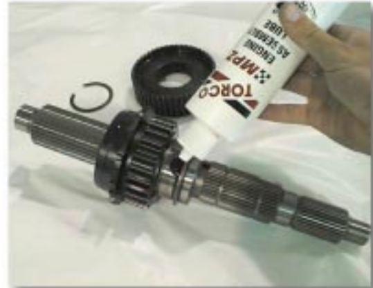
(Fig. 3A) New Main Output Shaft Assembly