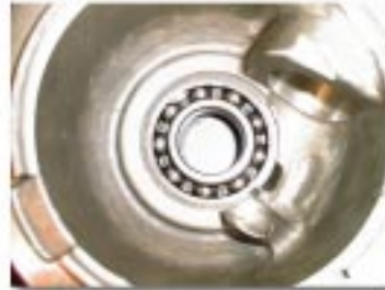
(Fig. 10A) Bearing Installed and Retained with the 716464 Snap Ring

SPECIAL NOTE: The components packaged in this kit have been assembled and machined for specific type of conversions. Modifications to any of the components will void any possible warranty or return privileges. If you do not fully understand modifications or changes that will be required to complete your conversion, we strongly recommend that you contact our sales department for more information. This instruction sheet is only to be used for the assembly of Advance Adapter components. We recommend that a service manual pertaining to your vehicle be obtained for specific torque values, wiring diagrams and other related equipment. These manuals are normally available at automotive dealerships and parts stores.