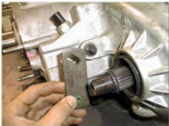
(Fig. 2) Range Selector Removal